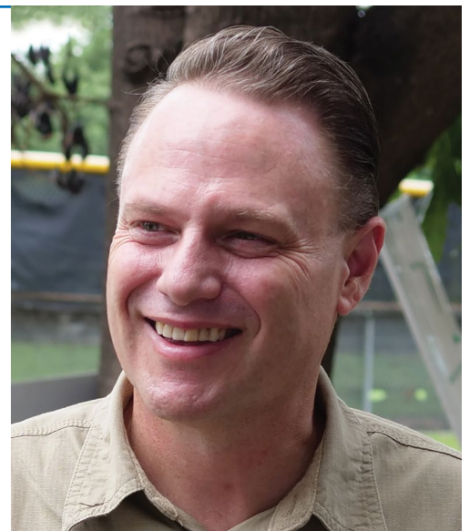
Lord Mayor, Adrian Schrinner

When challenges come our way in Brisbane - our community always comes together.