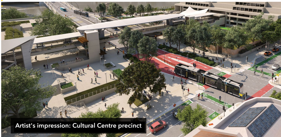
Artist's impression: Cultural Centre precinct

Moving around the city will soon be easier with a new cycleway connecting South Brisbane to the CBD, a new bike path on Grey Street and upgraded walking paths on Victoria Bridge. It's all part of our commitment to keep Brisbane moving.