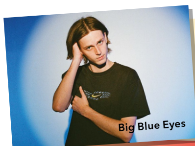
Big Blue Eyes

Award winners will be announced at the awards night in May.