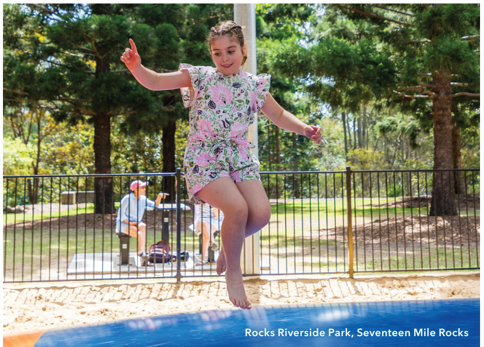
Rocks Riverside Park, Seventeen Mile Rocks