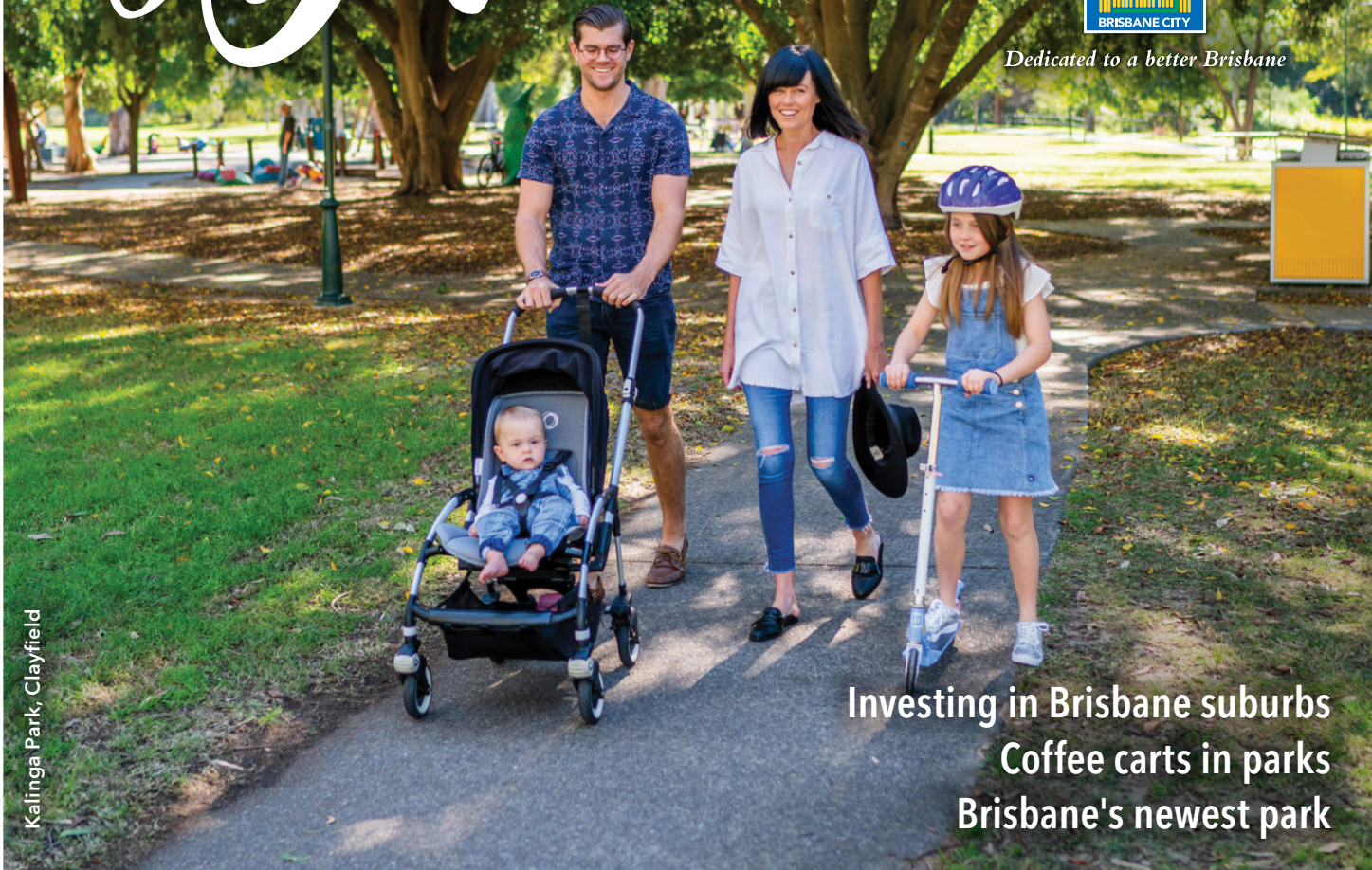
Kalinga Park, Clayfield

Investing in Brisbane suburbs Coffee carts in parks Brisbane's newest park