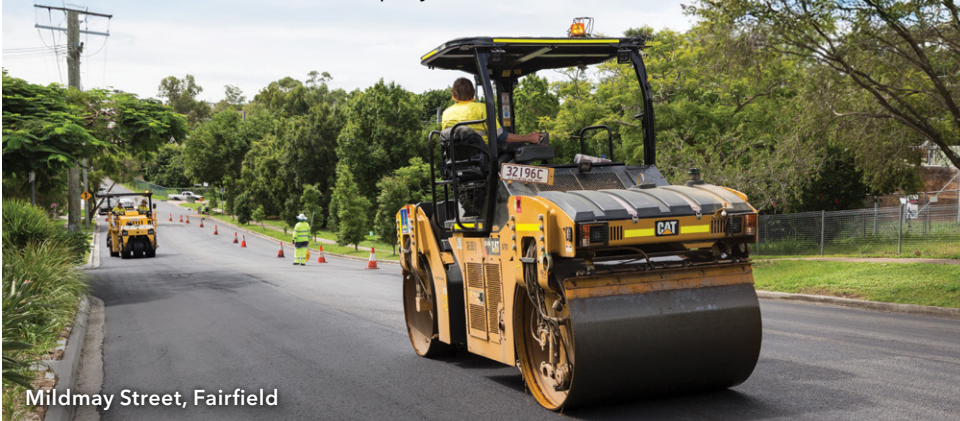
Mildmay Street, Fairfield

Visit our website to report a pothole or road damage or find information on road projects.