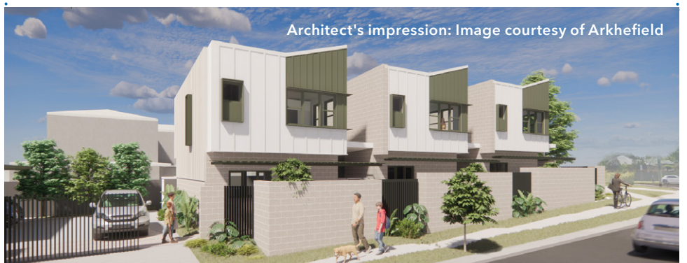
Architect's impression: Image courtesy of Arkhefield

It's all about striking a balance to encourage more homes in the right places while protecting Brisbane's low-density suburbs and our incredible lifestyle.