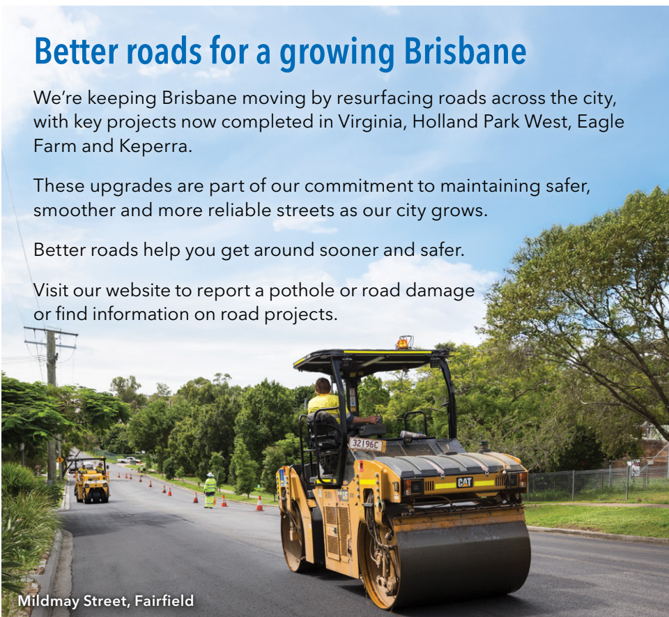
Mildmay Street, Fairfield

Visit our website to report a pothole or road damage or find information on road projects.