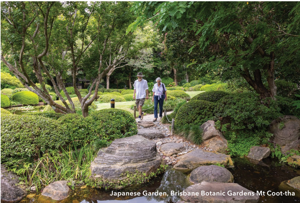
Japanese Garden, Brisbane Botanic Gardens Mt Coot-tha