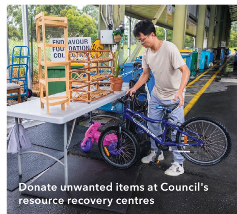
Donate unwanted items at Council's resource recovery centres