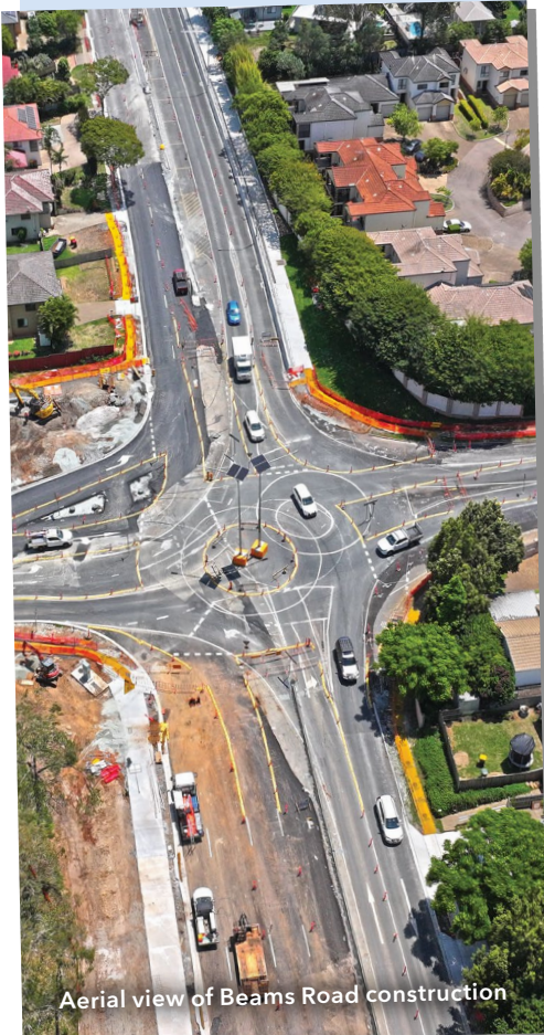
Aerial view of Beams Road construction

The Beams Road upgrade is jointly funded by our Better Roads for Brisbane program and the Australian Government.