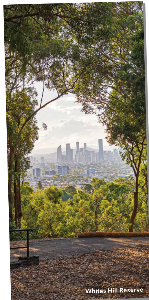
Whites Hill Reserve

The operational Council depot will remain while rehabilitation work, led by Brisbane Sustainability Agency, progresses.