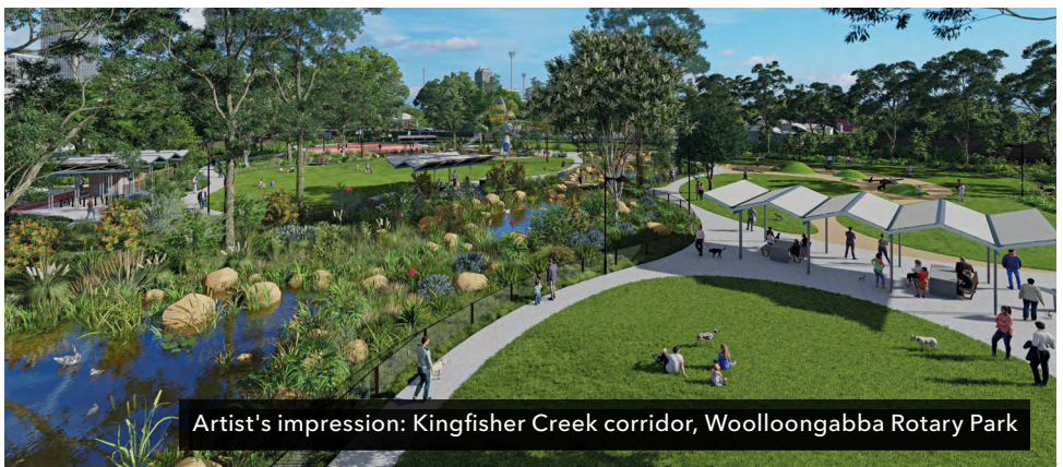
Artist's impression: Kingfisher Creek corridor, Woolloongabba Rotary Park

There's more for kids to see and do at the Wynnum Wading Pool Park, with a new shipwreck structure and beach cubby houses to explore. There's also a new accessible pathway linking play areas, as well as sand-digging equipment and new boulders with sculptures and artwork.