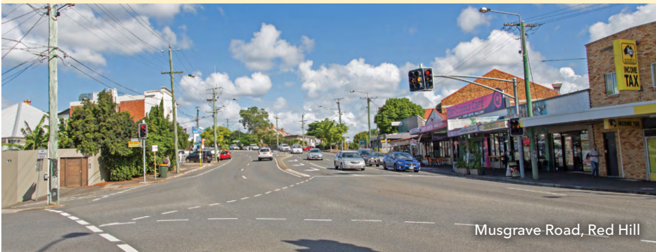
Musgrave Road, Red Hill

We'll review more major corridors in the coming years and work closely with residents and businesses to get the balance right. Go to our website and search 'clearway' for more information.