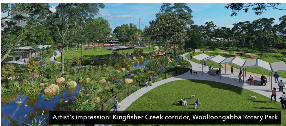
Artist's impression: Kingfisher Creek corridor, Woolloongabba Rotary Park

Graceville Riverside Parklands upgrades are due to start construction in 2026, including a new children's nature-play area, picnic facilities and a community lawn event space. We will turn the parklands into another exciting and unique destination within Brisbane's Oxley Creek Transformation corridor. This project received funding from the Australian Government.