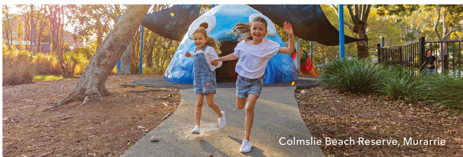
Colmslie Beach Reserve, Murarrie

Before visiting, check our website for any winter maintenance updates.