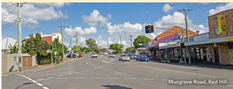
Musgrave Road, Red Hill

We'll review more major corridors in the coming years and work closely with residents and businesses to get the balance right. Go to our website and search 'clearway' for more information.