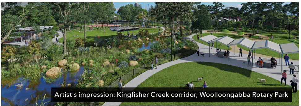
Artist's impression: Kingfisher Creek corridor, Woolloongabba Rotary Park

Keperra residents are invited to join the community in planting new street trees on Saturday 31 May. The event will celebrate National Reconciliation Week and involve planting culturally significant trees. Head to our website and search 'street and park trees' for more information.