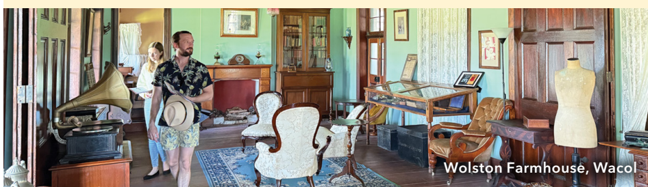
Wolston Farmhouse, Wacol

To celebrate Brisbane Open House weekend, on 18-19 July, we're giving one lucky winner a double pass to a ticketed building as well as a double pass to a Brisbane Open House event of their choice. To enter, visit our website and search 'Living in Brisbane competition'. Entries close 5pm Friday 12 June.