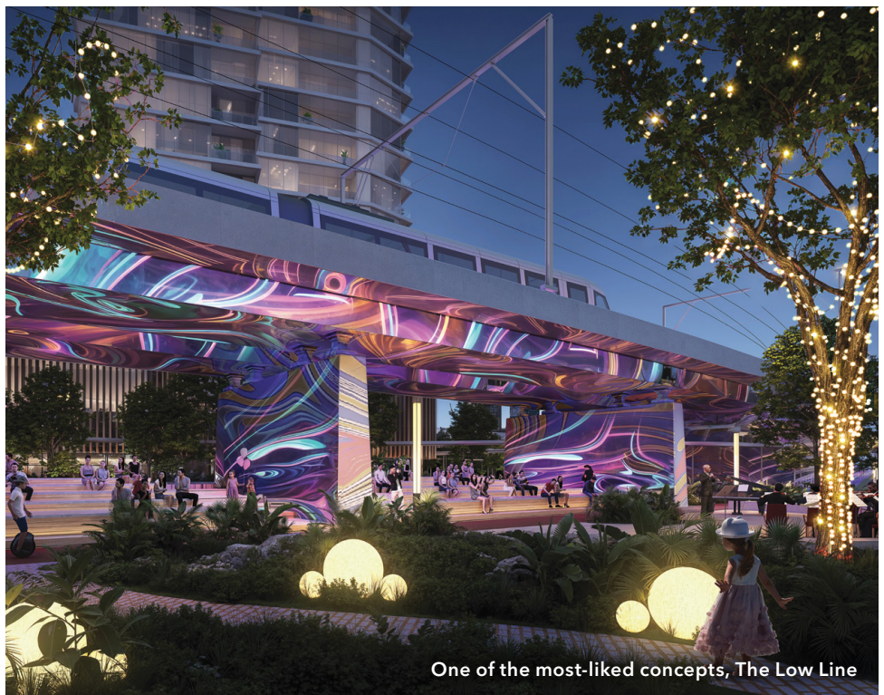
One of the most-liked concepts, The Low Line