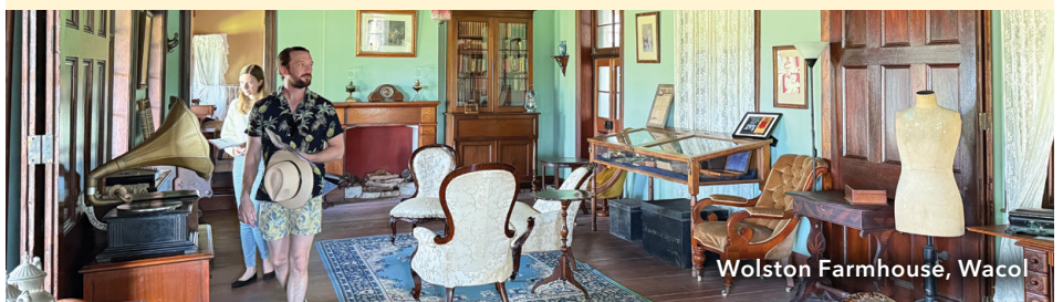
Wolston Farmhouse, Wacol

To celebrate Brisbane Open House weekend, on 18-19 July, we're giving one lucky winner a double pass to a ticketed building as well as a double pass to a Brisbane Open House event of their choice. To enter, visit our website and search 'Living in Brisbane competition'. Entries close 5pm Friday 12 June.