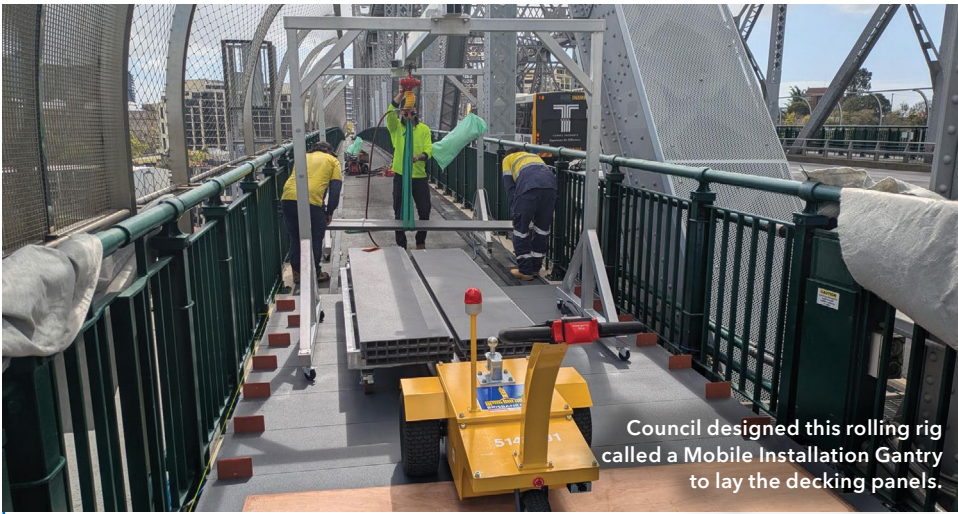
Council designed this rolling rig called a Mobile Installation Gantry to lay the decking panels.