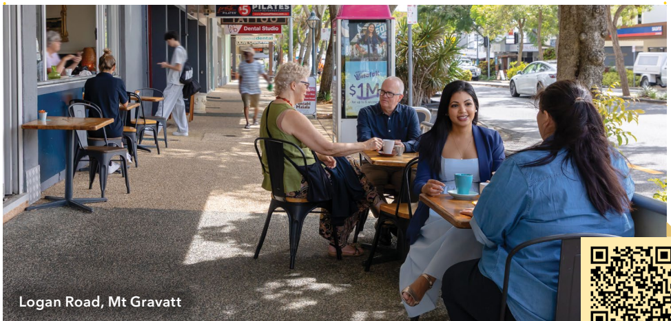
Logan Road, Mt Gravatt

Have your say on our draft suburban renewal plans for Wynnum, Mt Gravatt and Alderley by scanning the QR code below and subscribing to our Building and Planning e-newsletter to stay up to date.