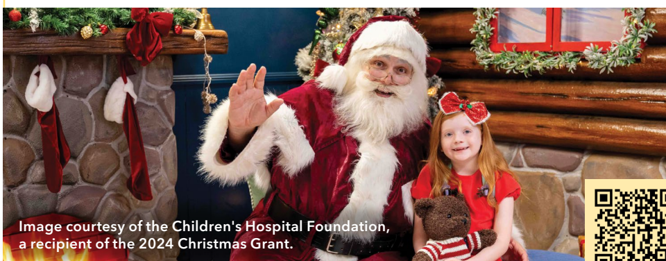
a recipient of the 2024 Christmas Grant.

Eligible charities can apply on the Trust's website before 5pm, Friday 17 October. Scan the QR code to learn more. These Christmas grants are one of several grant rounds offered by the Trust each year. Visit lmct.org.au/grants to find out more.