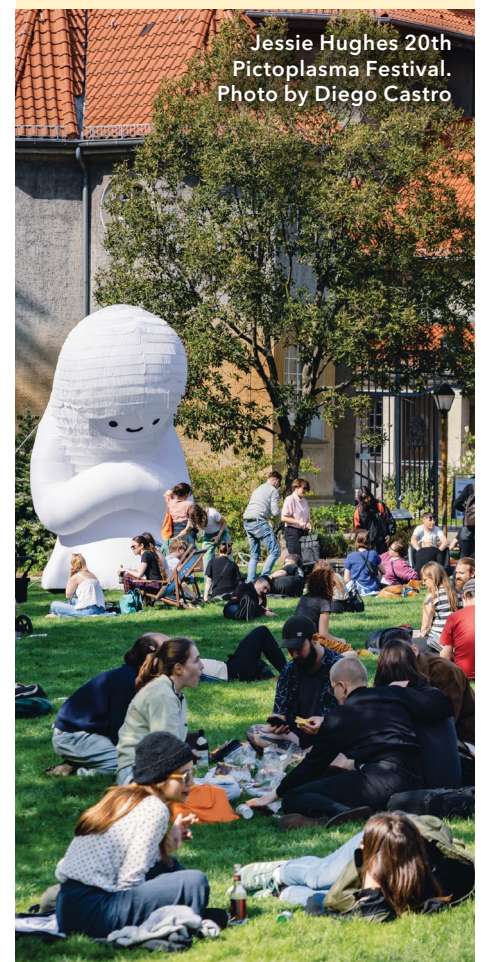
Jessie Hughes 20th Pictoplasma Festival.

To learn more about our grants and apply, search 'creative grants' on our website.