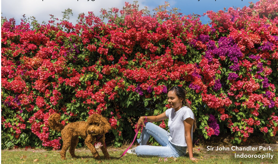
Sir John Chandler Park, Indooroopilly

Search 'parks and playgrounds' on our website to find your perfect park.