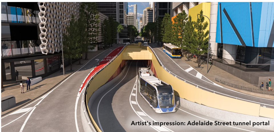
Artist's impression: Adelaide Street tunnel portal