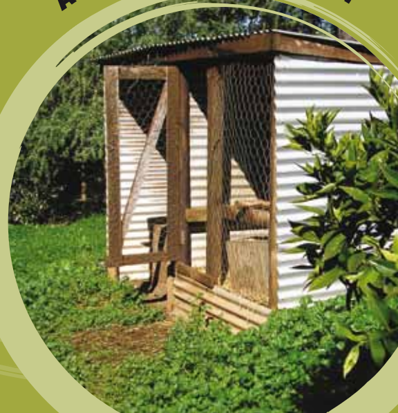
Image second from top: © State of Queensland, Department of Employment, Economic Development and Innovation, 2009 Bottom image: © H. Hoffman