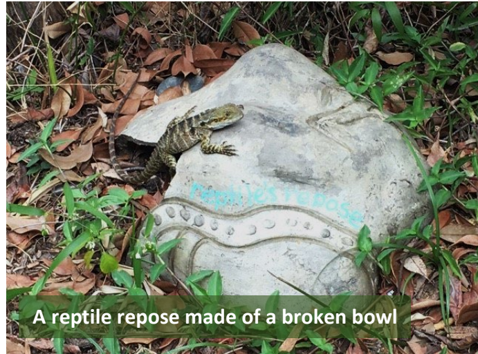
A reptile repose made of a broken bowl