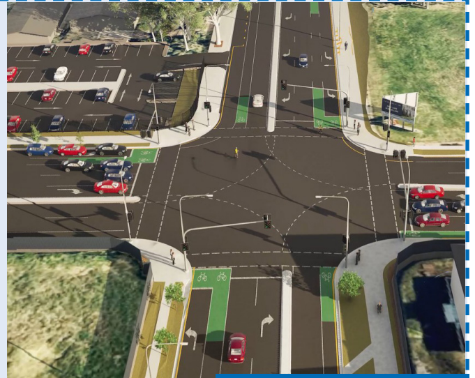
Artist impression - Rochedale Road and Gardner Road intersection.