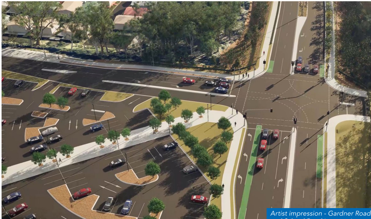
Artist impression - Gardner Road and School Road intersection.

More construction detail will be provided closer to the start of works.