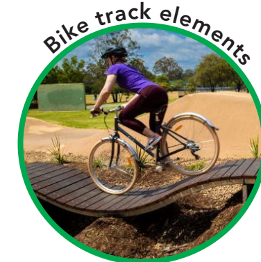
Bike track elements