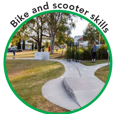
Bike and scooter skills