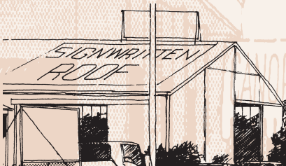
Signwritten Roof Sign