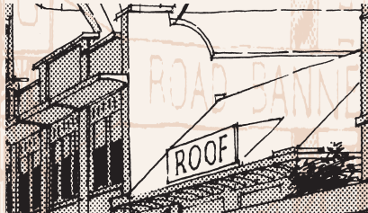
Roof Sign (less than 5m 2 )