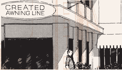
Created Awning Fascia Sign