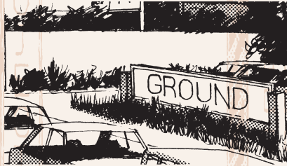
Ground Sign (less than 6m 2 )