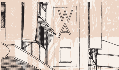
Wall Sign (less than 5m 2 )