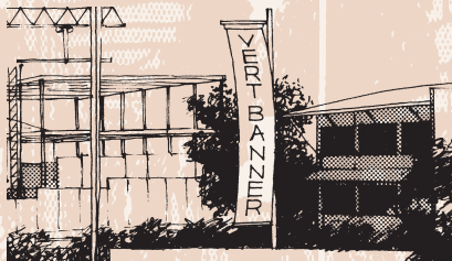
Vertical Banner Freestanding Sign