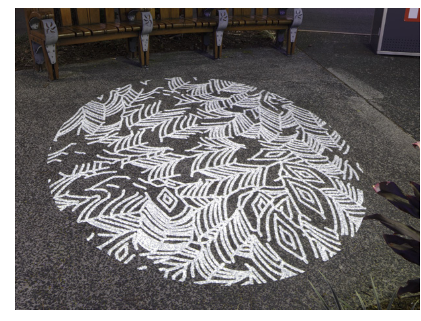
Creative lighting outcome – gobo projection