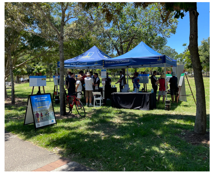
Community information session at Guyatt Park, St Lucia.