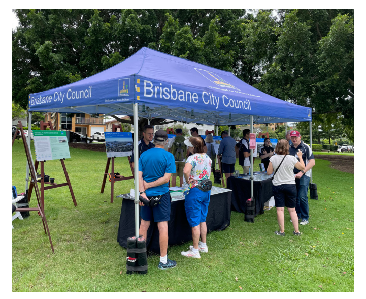
Community information session at Orleigh Park, West End.